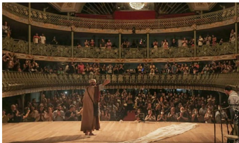
Stage performance based on the "The Prophet" by Khalil Gibran (Brazil). Acropolis News

Love is the force that drives us to do things well, in which case it is related to ethics and morality, because it induces us to act in an appropriate way in our lives. In this way, it leads us to peace, tranquillity, fullness and well-being with ourselves and with others. To quote the words of a wise man: