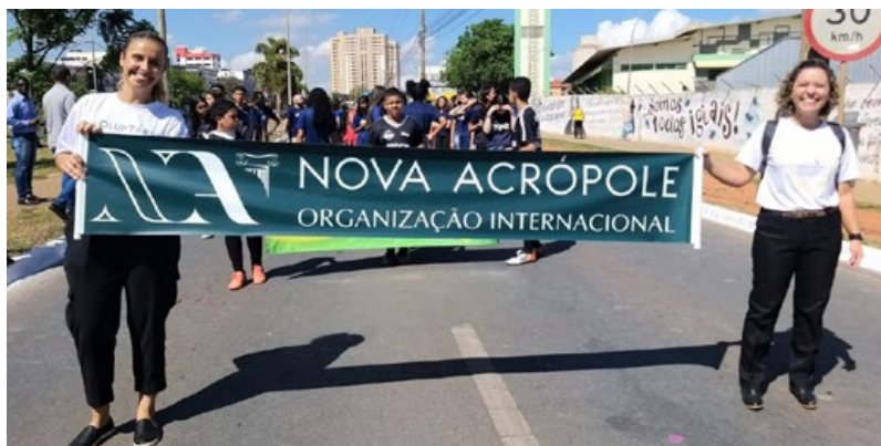
New Acropolis participates in a civic parade (Samambaia, Brazil). Acropolis News

Once they have passed this introductory course, students receive a certificate of completion. It is then up to each student whether they wish to continue