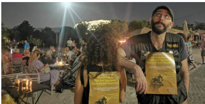
Promotion of the Self-Awareness Seminar under the Parthenon (Greece-Athens), Acropolis News

"152. The art of the ugly soul. Art is confined within too narrow limits if it be required that only the orderly, respectable, well-behaved soul should be allowed to express itself therein. As in the plastic arts, so also in music and poetry: there is an art of the ugly soul side by side with the art of the beautiful soul; and the mightiest effects of art, the crushing of souls, moving of stones and humanising of beasts, have perhaps been best achieved precisely by that art."