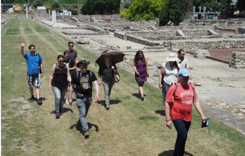
A visit to Aquincum, an ancient Roman city (Budapest, Hungary). Acropolis News

This level is unrelated to any past or present religion, political ideas, differences of races or sexes, nationalities or social classes, as New Acropolis establishes in its Principle of Universal Fraternity.