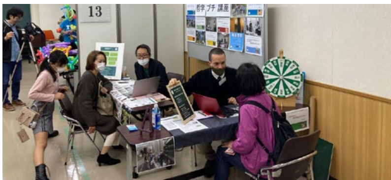
Participation in the Kanagawa Minato Festa 2022 (Yokohama, Japan).

But we can refer to the short and medium term.