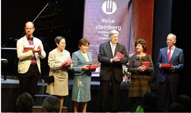
38th Edition of the Delia Steinberg International Piano Competition (Spain). Acropolis News

Clearly, this will not help us to make the world a better place. The lack of aesthetics and, on occasions, of morality, even if it seeks to offend an over-conventional sensibility, does not offer an edifying model, nor one worthy of being imitated.