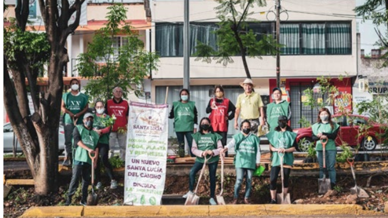
Reforestation on the bicycle path (Mexico), Acropolis News