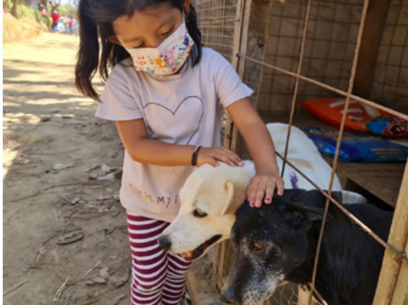
Volunteering at the "Animal Aware" shelter (Antigua Guatemala, Guatemala). Acropolis News

each volunteer should develop qualities within themselves, at the same time as they are giving unselfishly for the common good.