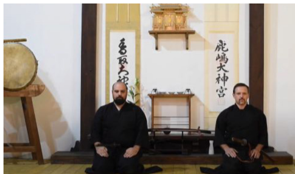
Lecture series on Japan with laido demos (Montevideo, Uruguay).

That is why, in New Acropolis, we speak of a philosophy of causes, which can also be called natural or esoteric philosophy, because we are interested in understanding the reasons behind things, their hidden causes, which we can perceive by using our reason or our intuition. To do this, we need to develop a greater degree of sensitivity and a greater capacity to connect and fit together the elements around us.