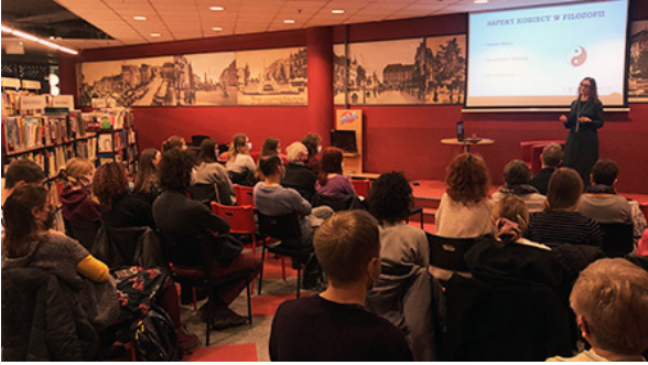
Women in Philosophy (Poland), Acropolis News