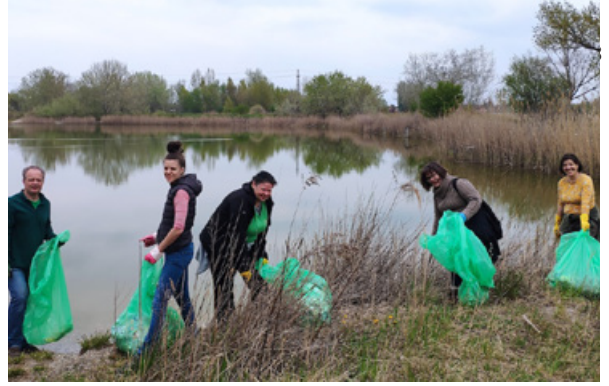
Lake cleaning on Earth Day (Győr, Hungary).

We do indeed have to go back to the past to find these types of misunderstandings. In