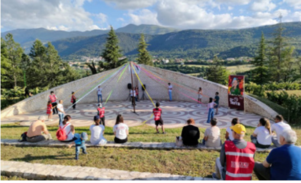
World Earth Day 2022 "To Earth" (L'Aquila, Italy), Acropolis News

Our teachers are qualified at one or other of these levels.