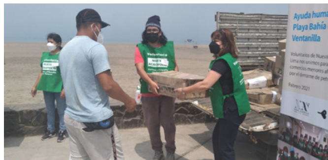
Humanitarian aid for small businesses affected by the oil spill (Lima, Peru) Acropolis News

criteria do the parties follow to select their candidates? It's a good question.