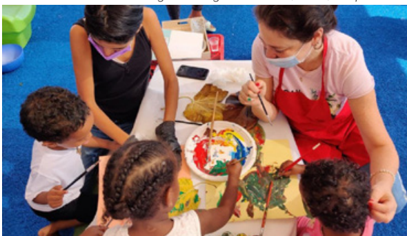
Volunteering in Kindergarten (Tel Aviv, Israel), Acropolis News

Following the model of institution-specific studies, and in view of the fact that our programme of studies is very wide-ranging, we have structured our academic levels into: Expert Diploma, Specialist Diploma, and two levels of Master's Degrees.