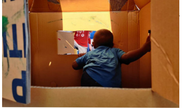
Volunteering in Kindergarten (Tel Aviv, Israel)

Philosophy can be combined with any facet of the human being: with art in its intuition of the beautiful, with science in its desire to