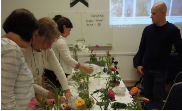
Ikebana workshop (Prague, Czech Republic)

are used by employees of large and small companies, clothing and footwear brands, sports and cultural associations, financial corporations, etc. The use of symbols is something that has been and continues to be present at all times and in all places.