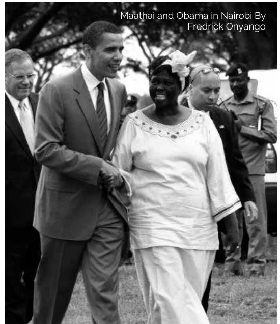
Maathai and Obama in Nairobi

loans are repaid, which shows the honesty and reliability of poor borrowers. Another innovation is that the client must have a savings account and make a minimum (even very small) deposit each month. They must also sign a charter similar to that of a religious primary school (18) based on moral behaviour! Thus, the Grameen Bank is truly a project of civilization!