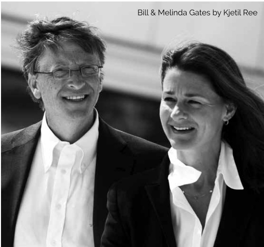
Bill & Melinda Gates

launched the project "The Green belt movement" by planting seven trees for Earth Day. Its goal was simple: plant trees to save Kenya and the world. When the media came to interview her, she explained the purpose of the project and then said, "That's enough now, everyone with me into the fields!" It is with this vision of human solidarity and militancy that she managed to plant thirty million trees in Kenya for the public good: a wonderful inspirational example for all the world's idealists.