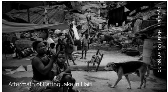
Aftermath of Earthquake in Haiti

On the social level , we are seeing a constant increase in the waves of migration of the poorest people going in search of new hopes for a better quality of life in the richer countries.