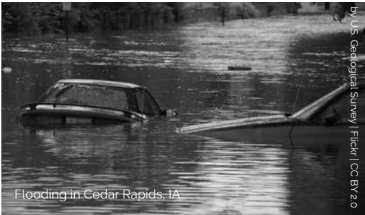
Flooding in Cedar Rapids, IA

On the ecological level , this can be seen in the excessive, irrational and selfish exploitation of the natural resources of our planet Earth.