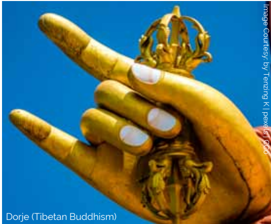
Dorje (Tibetan Buddhism)

The Western philosopher who most explicitly described this and laid this out was the great philosopher Plato. Plato lived in Ancient Greece in the 4th and 5th centuries B.C.E. One of the landmark moments in Western Civilization is the infamous and unfortunate death of Socrates in 399 B.C.E. Socrates was Plato's master, and after Socrates execution Plato promised to dedicate himself to expanding the philosophy that Socrates taught.