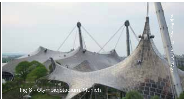
Fig 8 - Olympic Stadium, Munich