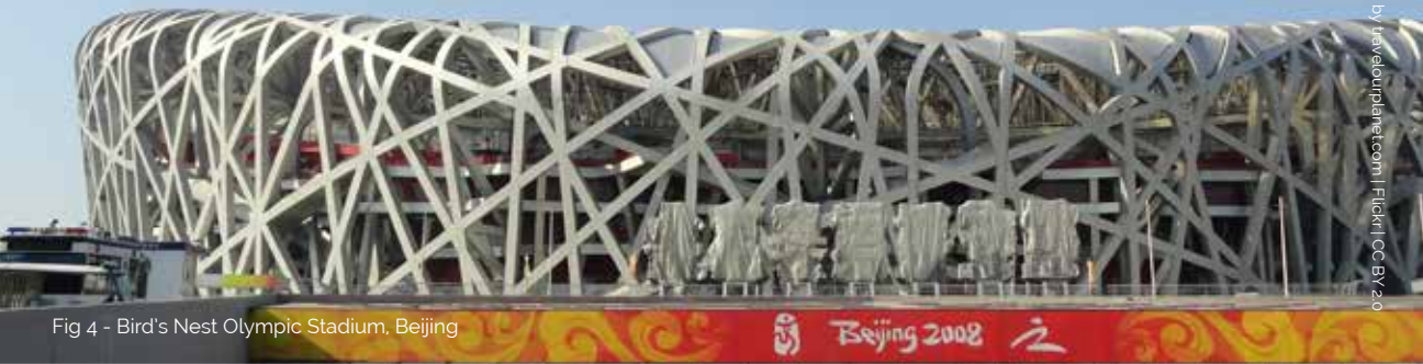
Fig 4 - Bird's Nest Olympic Stadium, Beijing