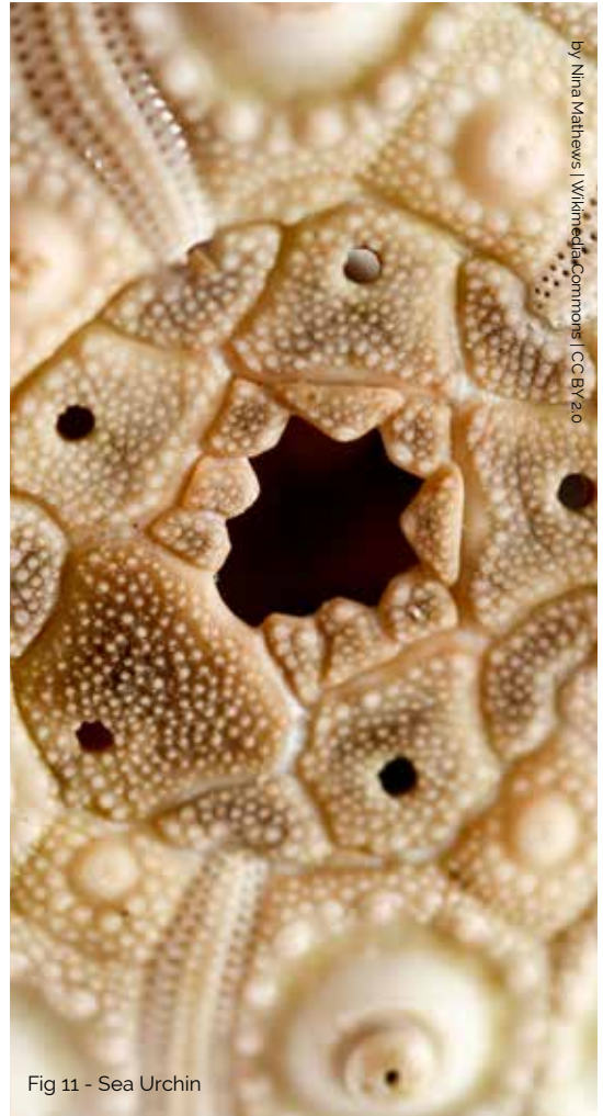
Fig 11 - Sea Urchin

The examples discussed above demonstrate the existence of intelligence in nature, responsible for the constitution of every little particle. In nature, nothing seems random and everything has its place and shape needed to better serve the whole. The wisdom of nature has still much to unveil to man, but this will only be possible, as the philosophical traditions say, when humans actually feel committed to their surroundings and responsible for the proper application of the teachings. ★★★