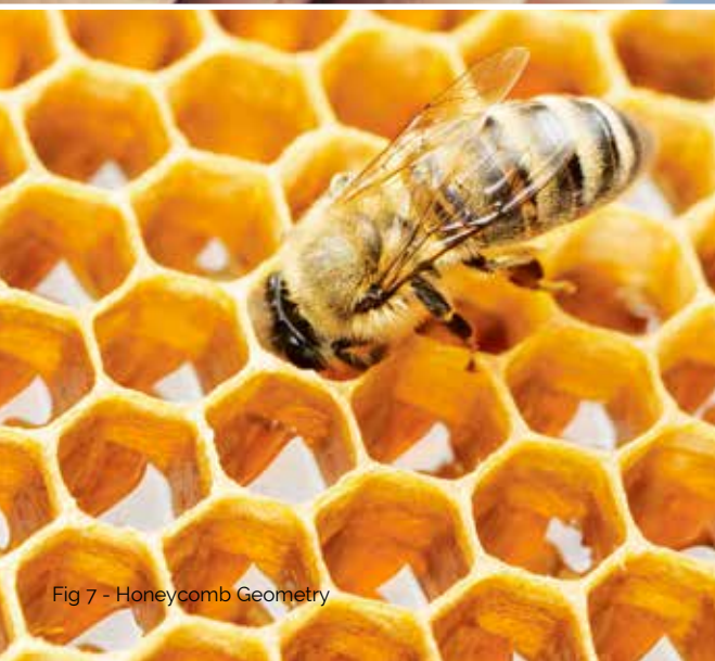
Fig 7 - Honeycomb Geometry