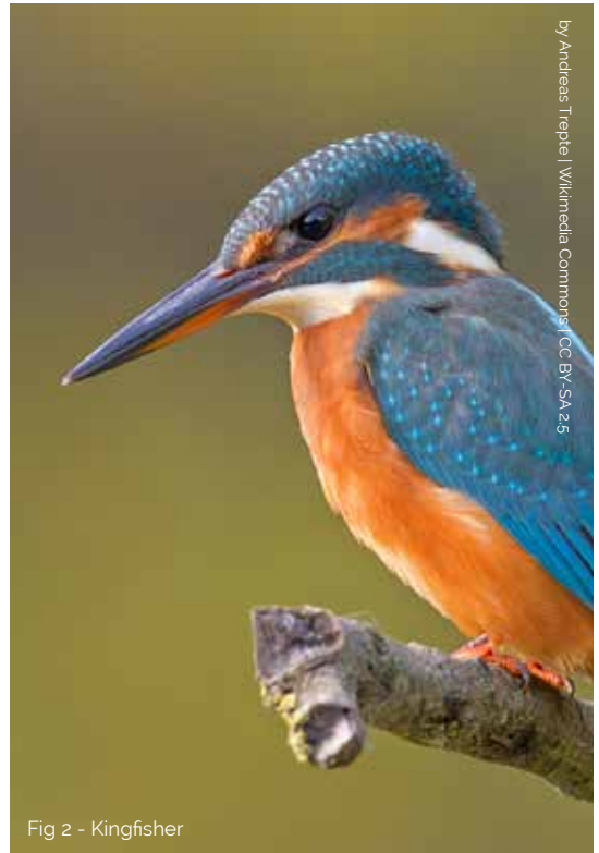
Fig 2 - Kingfisher

The great biomimetic innovations of mankind alert and question: What will the Biomimicry Revolution do differently than the Industrial Revolution? Who can assure that the thunder of nature will not be stolen and used in a campaign against life? This is not an infantile concern; one of the most important biomimetic inventions was