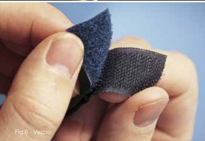
Fig 6 - Velcro