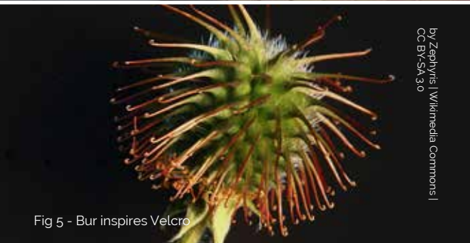
Fig 5 - Bur inspirates Velcro