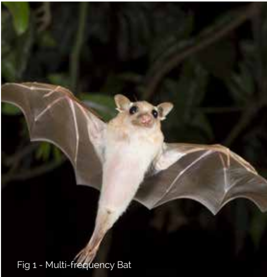
Fig 1 - Multi-frequency Bat

Nature as a mentor: New way to observe and evaluate nature. Do not worry about what we can extract from the natural world, but what we can learn from it.