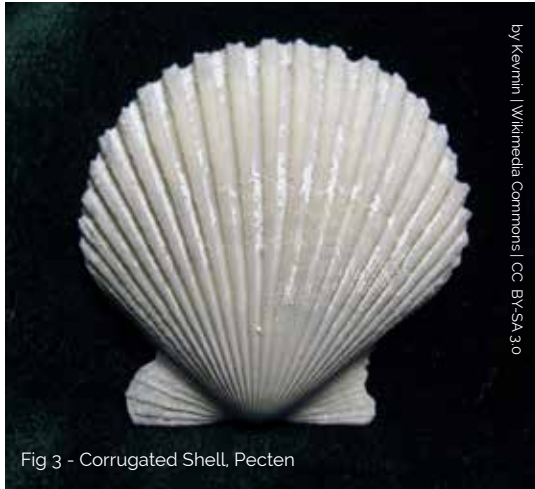
Fig 3 - Corrugated Shell, Pecten

the airplane, inspired by the flight of birds. Men flew for the first time in 1903, but in 1914, were already dropping bombs from the sky. Maybe what is really necessary is not a technological change, but an internal change of mentality that allows for sensitivity to nature's lessons [1].