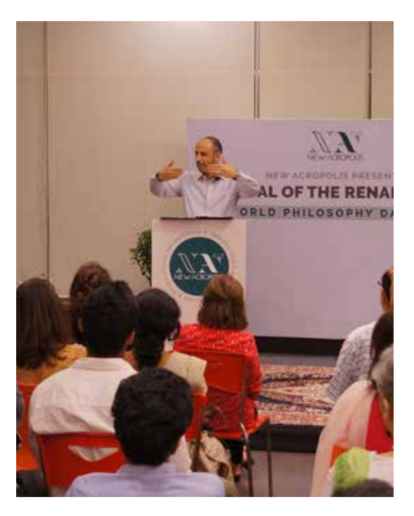
TA: But when one is so bogged down by the individual struggles of everyday life, in what way can philosophy be of practical help?

To act for the benefit of others by overcoming one's own propensity towards selfish interest is a challenge that philosophy can help one overcome.